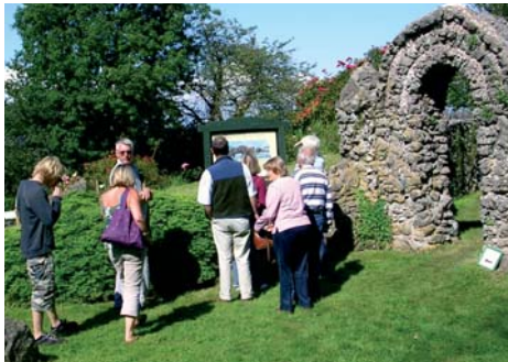
Visitors studying the notice board at the entrance to the Bone Cave

At the last open day on the 12th August nearly 300 visitors enjoyed an afternoon out at Banwell Caves. The weather was warm and sunny and the visitors enjoyed their cream teas on the terrace in between a tour of the Bone Cave, climb to the top of Banwell Tower and watching a film of the history of The Caves.